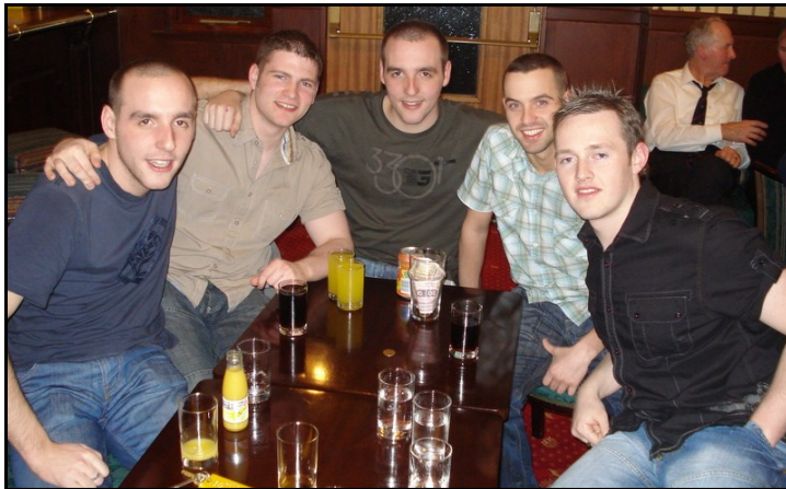
The Young Team

for all his hard work in not only organising the Mallaig Hotel but also the stop over lunches at Fort William and Callen-