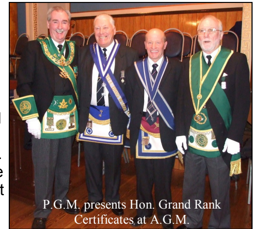
P. G.M. presents Hon. Grand Rank Certificates at A. G.M.