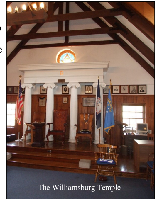
The Williamsburg Temple

On our way back from Jamestown we decided to pass through a town called Williamsburg where we planned on getting some food and a place to spend the night. On our way through the old town of Williamsburg we kept our eyes open for the Masonic hall as we knew there was a temple there but didn't exactly know where it was. As we travelled along the road into town, I suddenly noticed the Masonic Temple so we stopped the car for a