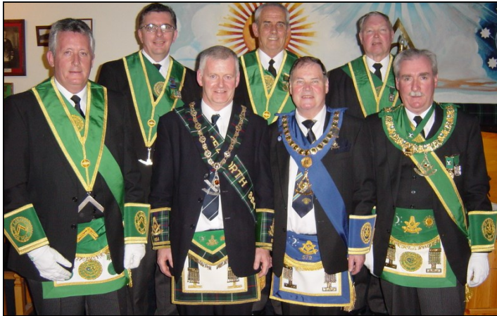
R.W.M.'s with P.G.M. and the P.G.L. Deputation.