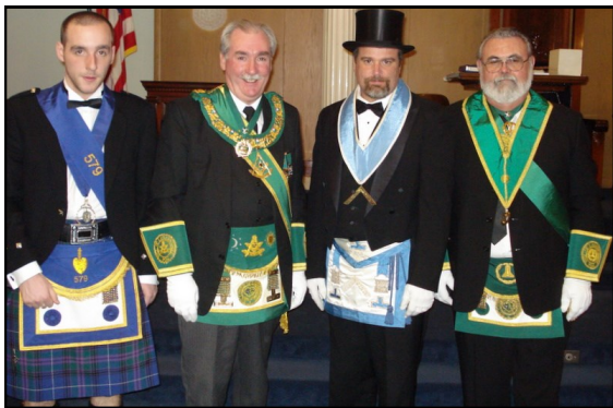
Visit to Robert Burns Lodge No. 464, Pennsylvania