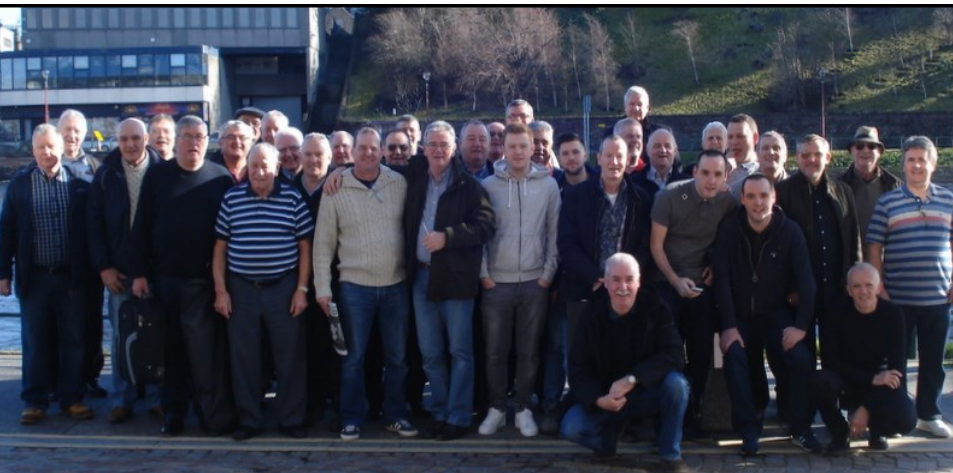
Members of the 2015 Visitation Team about to board the bus for the journey home.