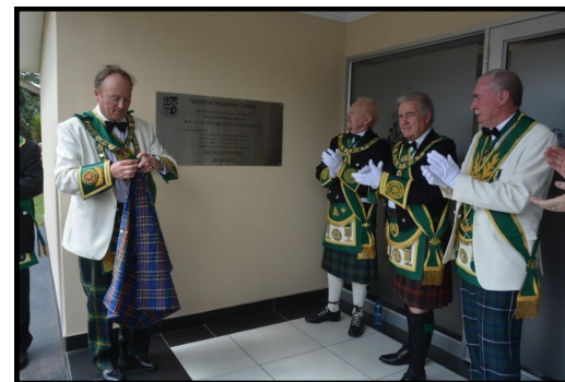
Grand Master declares the New Masonic Centre open