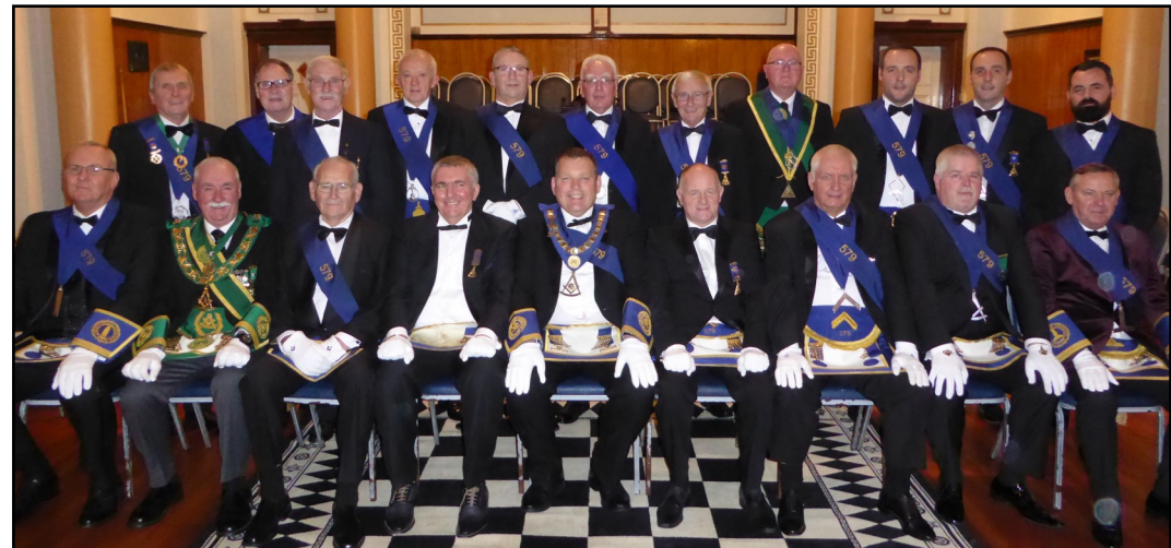
Lodge St. Bryde No. 579 Office-bearers 2018 —19