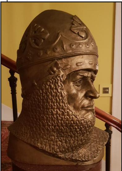
Photo. The prototype cast of King Robert The Bruce which was used at the Bruce Statue at Bannockburn.