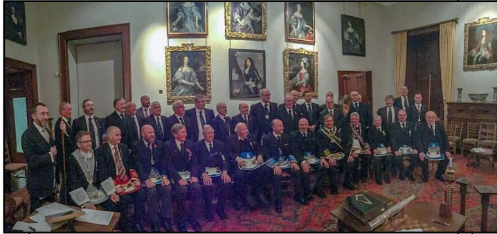
Members of Lodge Sir Robert Moray No. 1641 in Broomhall House

gave a short talk on the relationship between his ancestor and Sir Robert Moray which eventually led to the formation of The Royal Society.