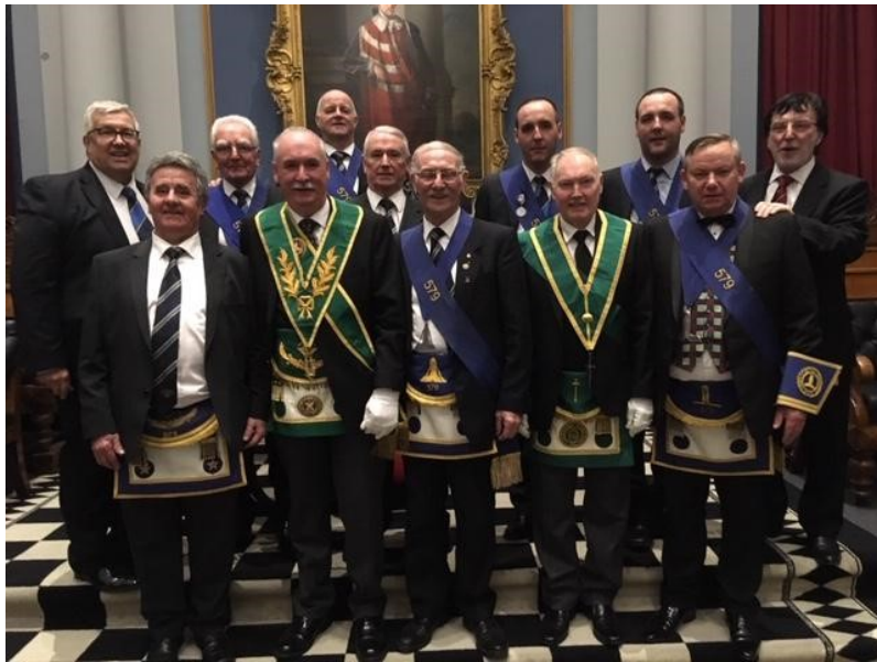
Lodge St. Bryde 579 Brethren in Freemasons Hall, Dublin.