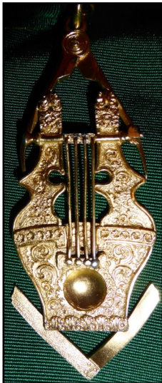
Grand Bard jewel dated 1837