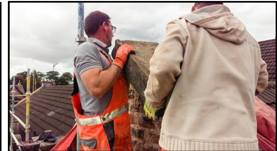
Left. Deterioration above the lounge window. Right. Top coping stones being removed above lounge window and re-bedded.