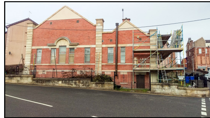
West Wall after