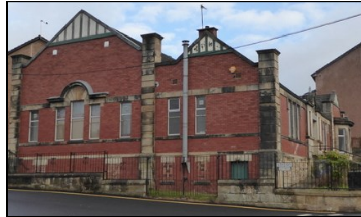
West Wall before

Sun. 29th. Lodge St. Bryde No. 579. Annual Divine Service at 6 for 6.30 p.m. in Uddingston Old Parish Church.