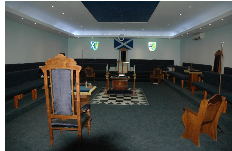
The new refurbished Temple.