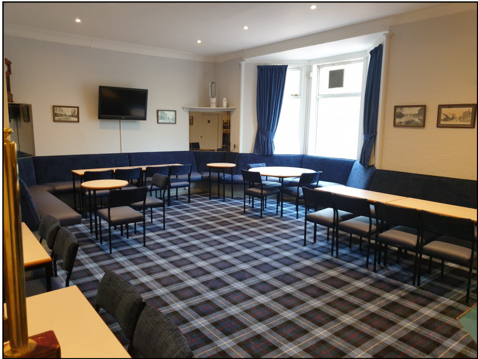
The Lounge after the recent refurbishment which took place during the last few months. New carpet, chairs and décor. Looking good !