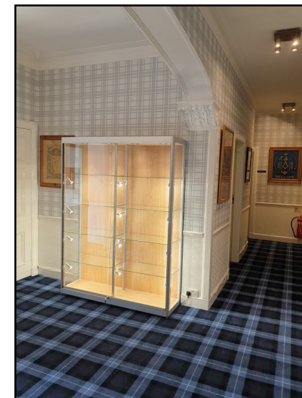
Corridor and Main Foyer with new display cabinet in position.