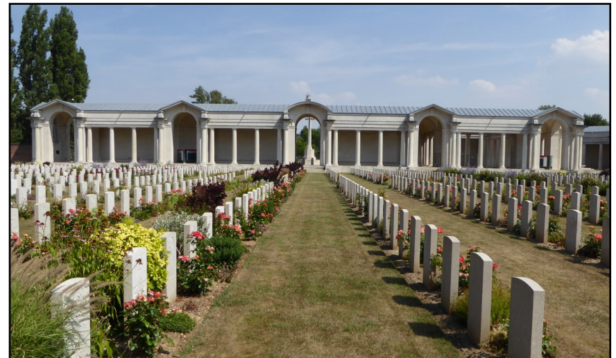
The Arras Memorial