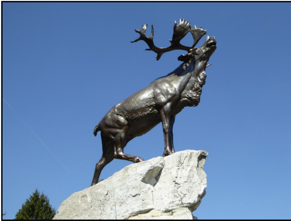
Newfoundland Memorial The Somme