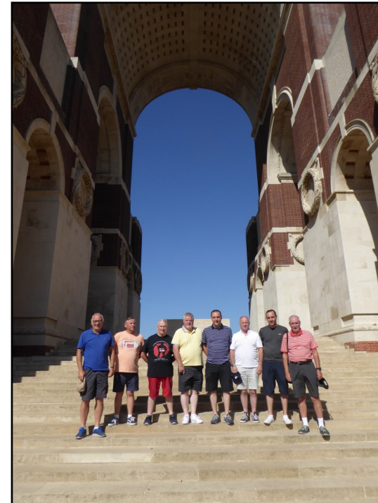
Lodge St. Bryde Members At Thiepval Memorial, The Somme.