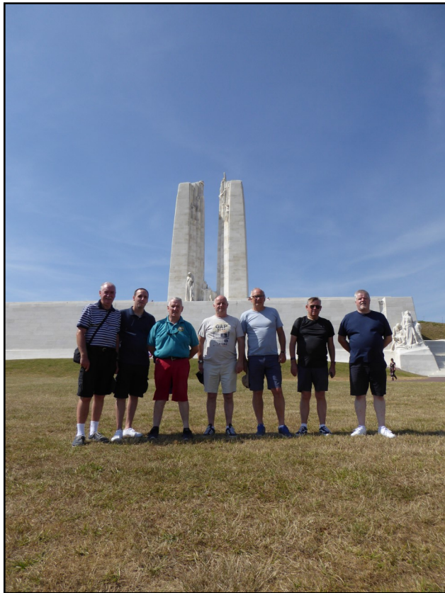
Lodge St. Bryde Members At The Canadian Memorial, Vimpy Ridge.

Lodge St. Bryde Brethren were commemorated at the Memorial, having been posted as missing in action in World War 1. The Brethren conducted a Service at the Memorial as our Brethren have no known grave.