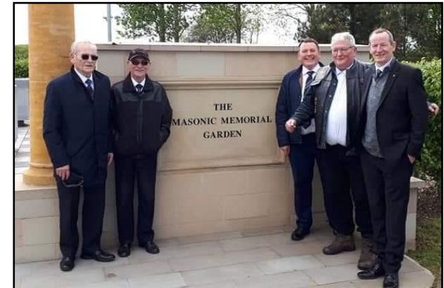
Photo. The Lodge St. Bryde Brethren visiting The National Memorial Arboretum at Stafford.